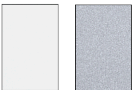
Bianco extra Extra white, Argento Silver