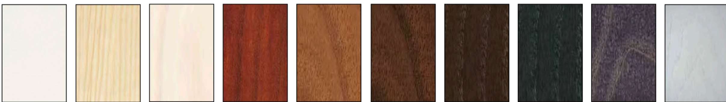
Bianco lipari Lipari white, Naturale "forever" Natural "forever", Naturale sbiancato Whitened natural, Mogano Mahogany, Noce biondo Blond walnut, Noce Walnut, Noce moka Moka walnut, Nero stromboli Stromaboli Black, Antracite Anthracite, Smoky